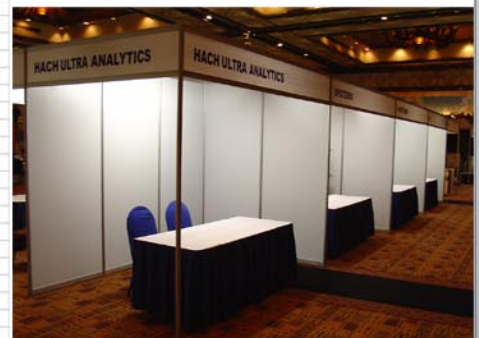
All stands are 3 x 2 metres